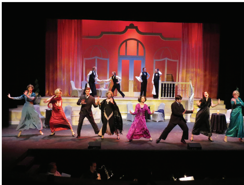
Circle Christian School’s highly-regarded theatrical program regularly puts on student productions at Orlando’s prestigious Repertory Theatre.

The Werners approach their work at CCS in a similar fashion. They devote a great deal of time and energy to