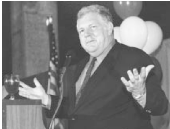
Dr. William J. Bennett giving the 2000 Speakers' Banquet keynote address. See page 2.